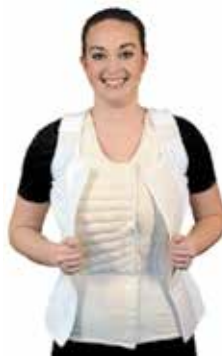
Vest with JoViJacket