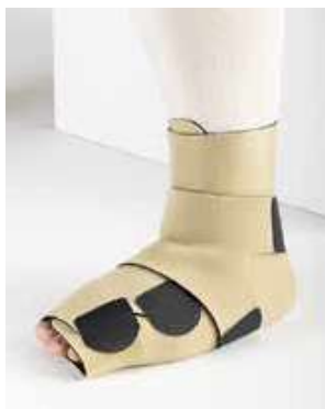
Compreflex Reduce Foot (p. 92)

The Lobe Sling pairs well with these products.