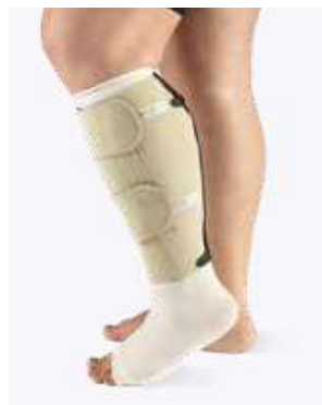
Compreflex Reduce Calf (p. 84)