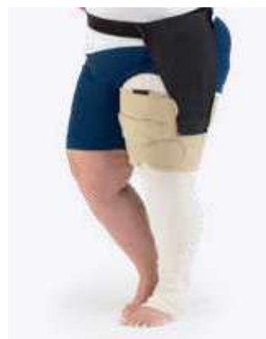
Compreflex Reduce Thigh (p. 86)